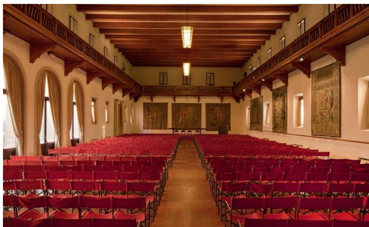
Sala degli Arazzi

This event is organised with the European Commission and in partnership with the Giorgio Cini Foundation .