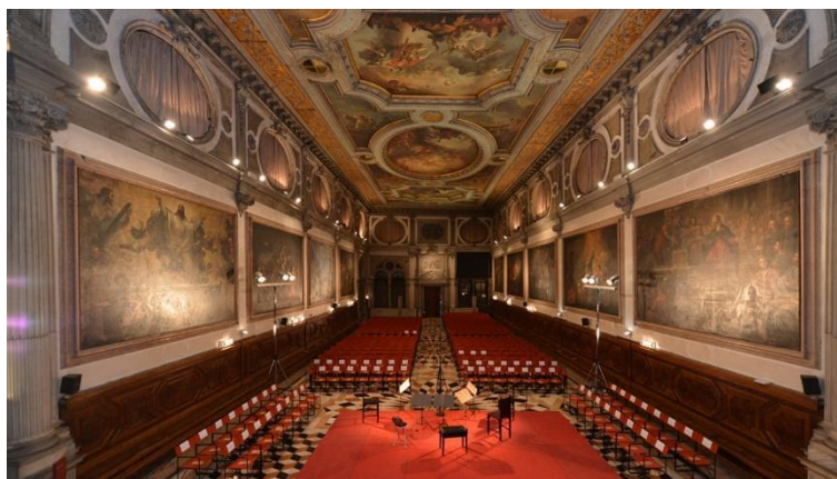
Scuola Grande di San Giovanni Evangelista with the stunning scalone by Renaissance architect Mauro Codussi.

The Programme of the Agora can be read and downloaded here .