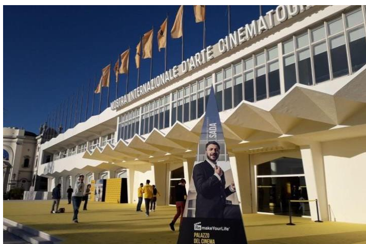
The iconic Palazzo del Cinema on the Lido, which has hosted the Venice International Film Festival since 1937.

The Ceremony will be livestreamed via the Europa Nostra website .