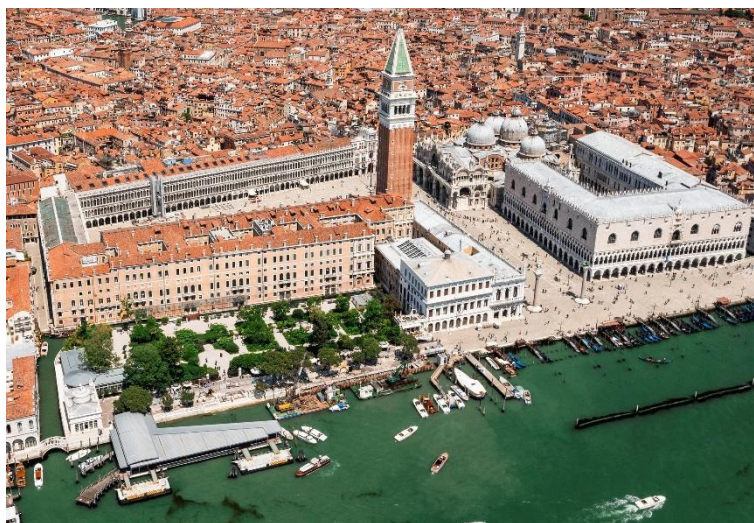
Royal Gardens of Venice

The restoration, management and future conservation of the gardens was entrusted to Venice Gardens Foundation by the State Property Office and the City of Venice in 2014.