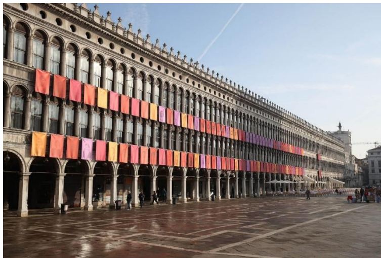
Procuratie Vecchie in St Mark's Square

The Home of the Human Safety Net will host the event at its premises at the Procuratie Vecchie in St Mark's Square. Built in the early 1500s, this landmark building recently underwent a comprehensive renovation led by Sir David Chipperfield, laureate of this year's Pritzker Architecture Prize.