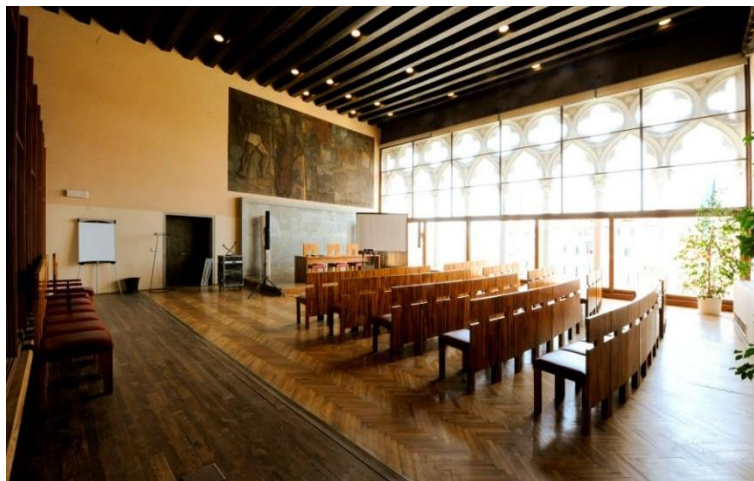
Aula Baratto