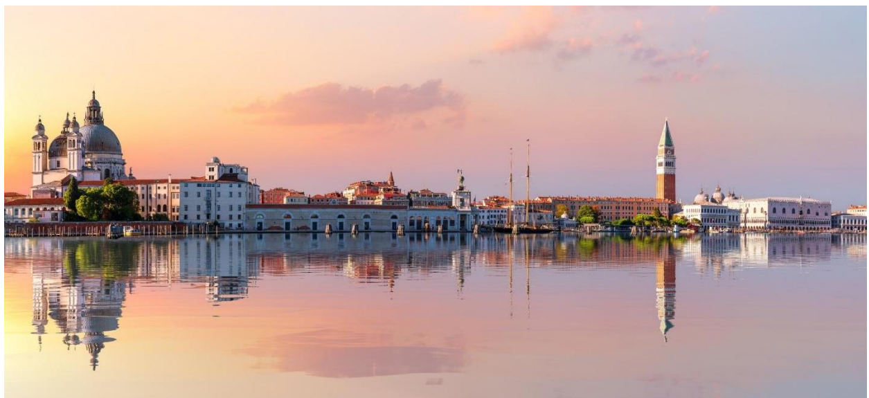
Panoramic view of Venice

Our 60th anniversary represents the perfect occasion to celebrate the significant contribution of our organisation to a value-based and culture-driven Europe, with the focus on the preservation of cultural and natural heritage in Europe and beyond. We shall also reaffirm our unwavering commitment to champion the vital role of heritage for tackling many challenges that our society and environment are facing today.